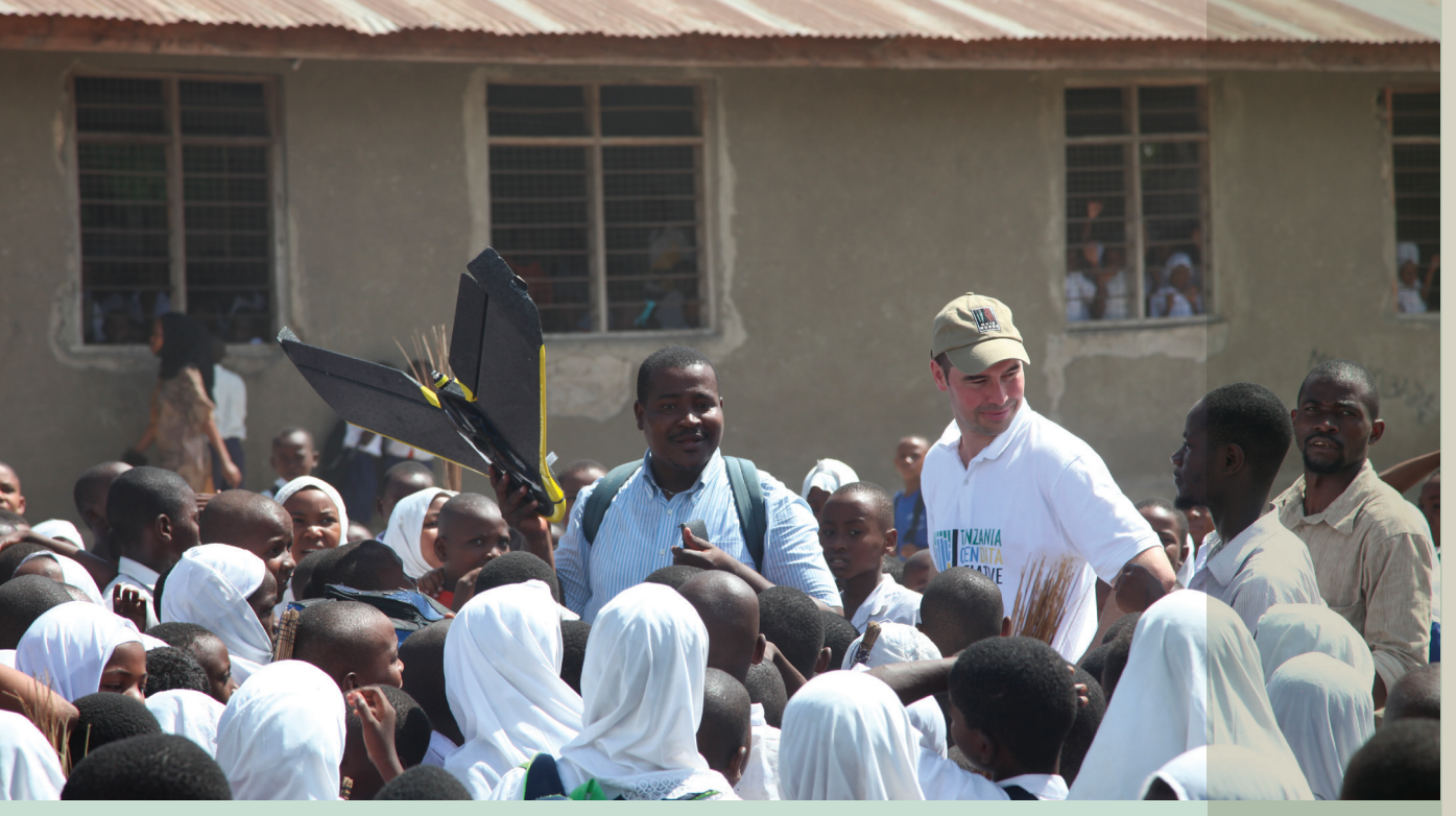
Figure 1 Launching and landing the drone at a local school courtyard.

In response to this data gap, the World Bank and the Red Cross began to support and scale up community mapping. A coalition comprising of the City Council of Dar es Salaam, the Tanzania Commission for Science and Technology (COSTECH), the University of Dar es Salaam, Ardhi University and Buni Innovation Hub formed a project in early 2015. Called Ramani Huria – Swahili for "Open Mapping" – the coalition set out to map flood-prone areas in Dar es Salaam, to make the mapping data openly available and to promote the use of this information in government decisions to mitigate flooding.<sup>2</sup>