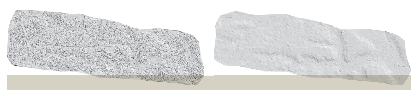
Figure 6 Using ground points, LAStools can develop a digital terrain model (DTM) from the digital surface model (DSM) removing the buildings, which is currently used to work out the hydrological model.

6 Edward Anderson. World Bank. Interview from 13 November 2015.