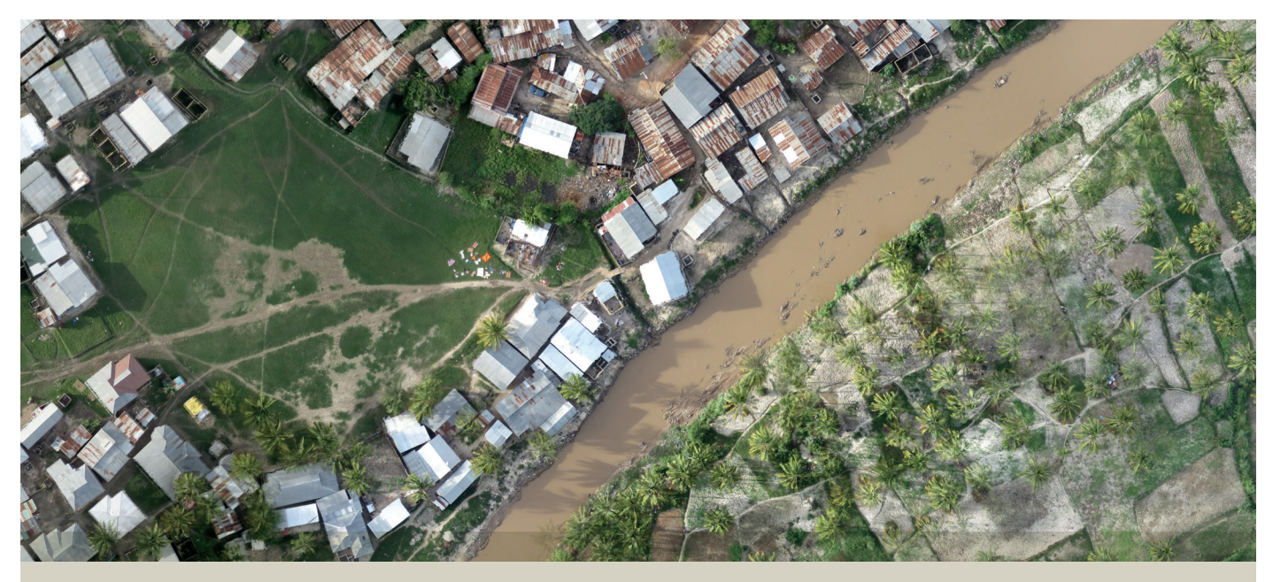
Figure 2 Extract orthomosaic.