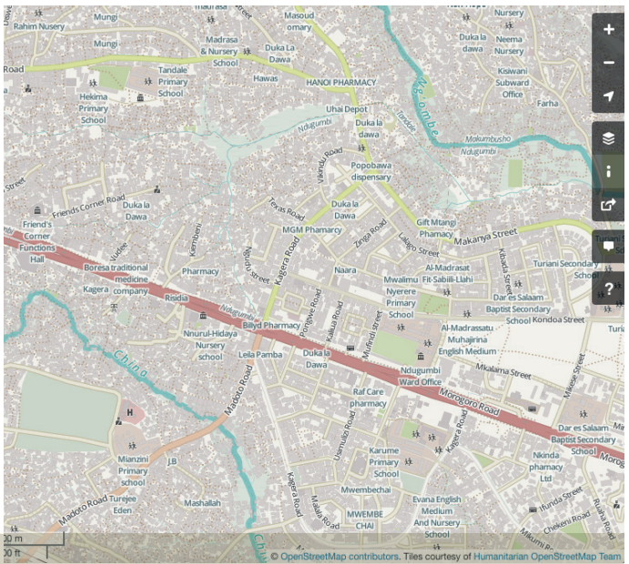
Figure 4 Level of detail available on OpenStreetMap shows the details of houses and roads. Retrieved on 3 December 2015.